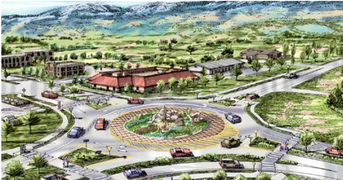
Artist rendering of Kietzke Lane/Neil Road Roundabout